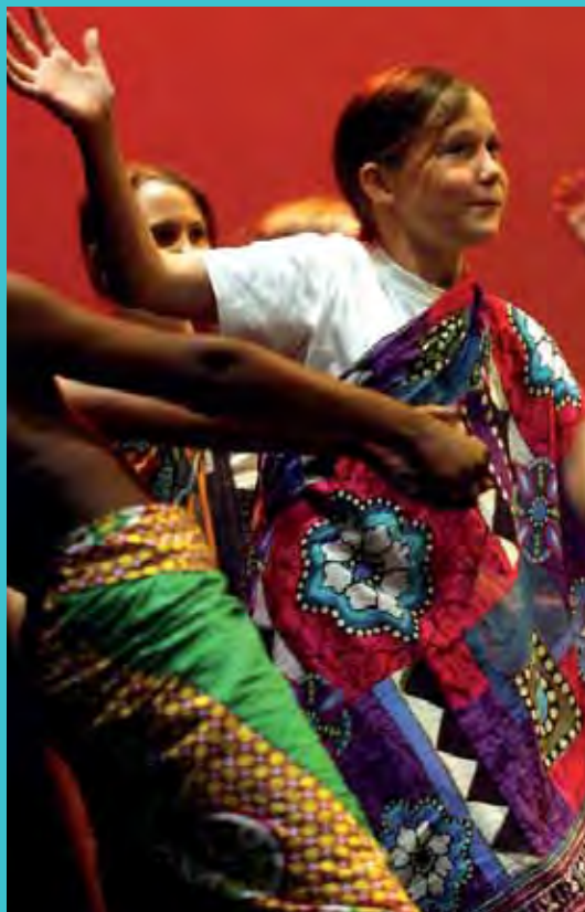
▶ All Saints C of E School performing their music with movement piece Salam Alekum at the South East Artsmark celebration event, June 2006.

We define learning outside the classroom as: