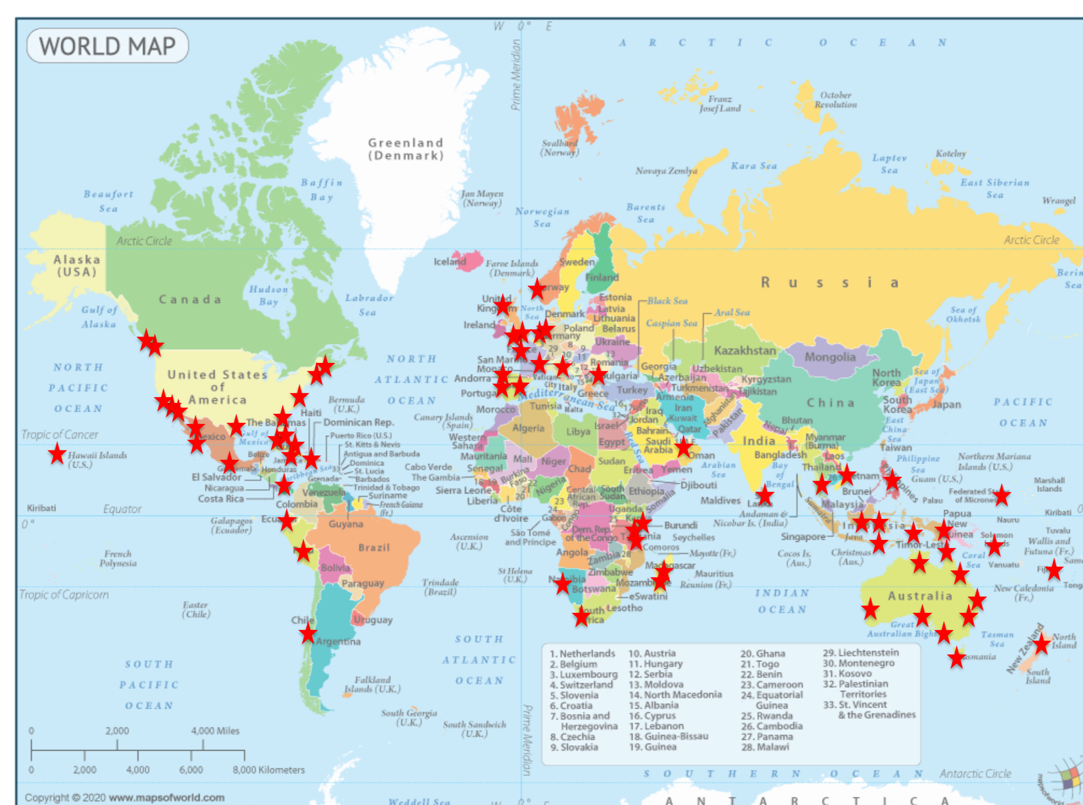
Figure 2. Geographic distribution of innovations, focused on sustainability, found.