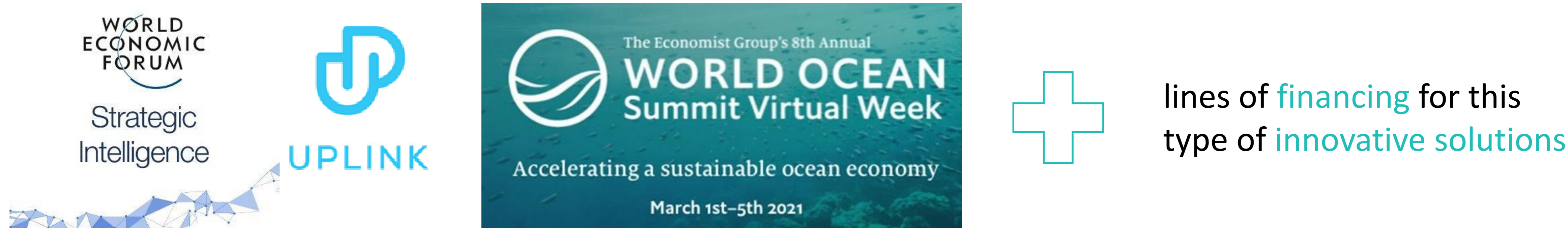
Figure 1. Tools used in the review.