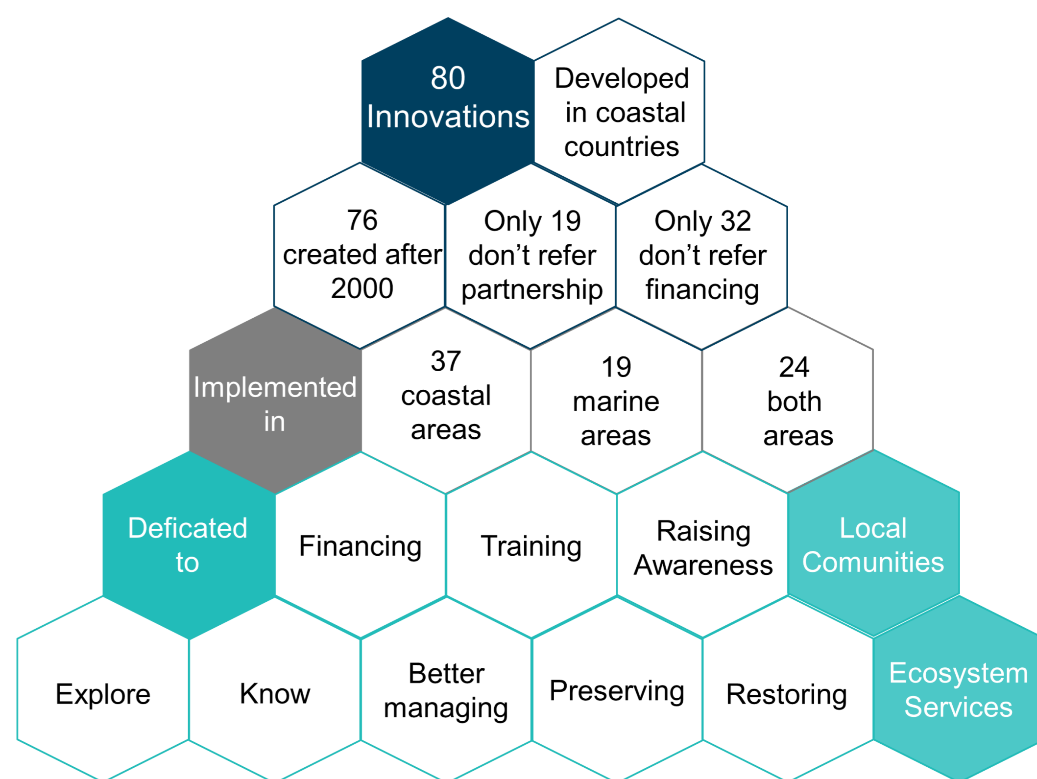
Figure 3. International trends in the development of innovations focused on sustainability, using coastal and marine ecosystem services as guideline.